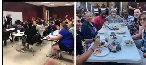
30+ Professional Development Hours!

A sample schedule for band directors includes: