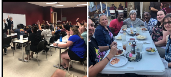
30+ Professional Development Hours!